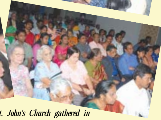
Members of St. John's Church gathered in full strength for the 150th Year Celebrations on May 4