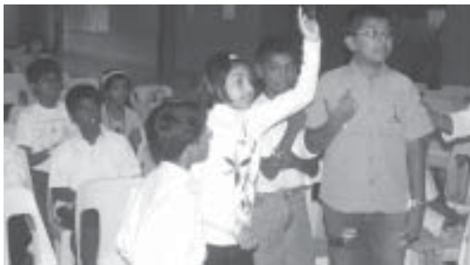
"We know the answer."

It's Quiz Time! We are constantly striving to make studying the Bible an enjoyable activity in a world with so many competing interests. One new initiative we introduced this year is a series of quizzes – the main purpose being to get the children to read the Bible carefully. Our first was based on the Gospel of Mark and the second was a Christmas one. Four teams: